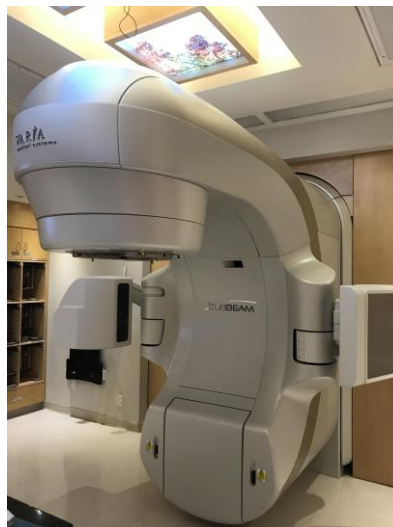
Parents' view of the treatment machine, or "Linear Accelerator"

Receiving radiation is like having an x-ray taken; there is no pain or sensation involved. Your child will not see or feel anything during the treatment, but the machines may make a soft buzzing noise.