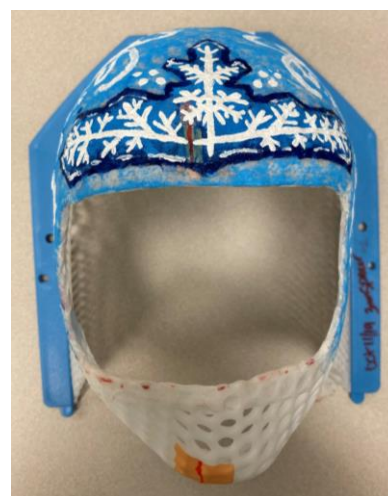
Mask/cast to keep the head/neck still during treatment.

In order to prepare for your child's treatment, you may be taken to the Mould Room, where a device to keep them still for treatment will be made. This device is often called a cast, and is made of plastic. The cast can be painted in the character of your choosing. Your child's position for treatment and the type of equipment needed will depend on the area where the radiation will be directed. If your child does not need a cast or other body mould, your next step will be a Simulation appointment.