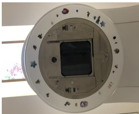
Child's view from the treatment bed

Your child will then be taken to the radiation machine, where treatment will begin. The Radiation Therapists will position your child on the table. It is important that your child not move during the set-up or during the treatment itself. Actual treatment time takes only a few minutes, but the