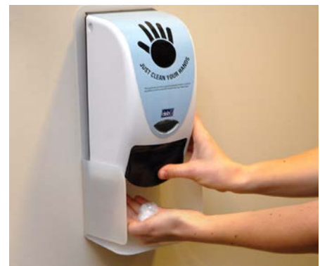
alcohol based hand rub