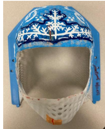
Mask/cast to keep the head/neck still during treatment.

In order to prepare for your child's treatment, you may be taken to the Mould Room, where a device to keep them still for treatment will be made. This device is often called a cast, and is made of plastic. The cast can be painted in the character of your choosing. Your child's position for treatment and the type of equipment needed will depend on the area where the radiation will be directed. If your child does not need a cast or other body mould, your next step will be a Simulation appointment.