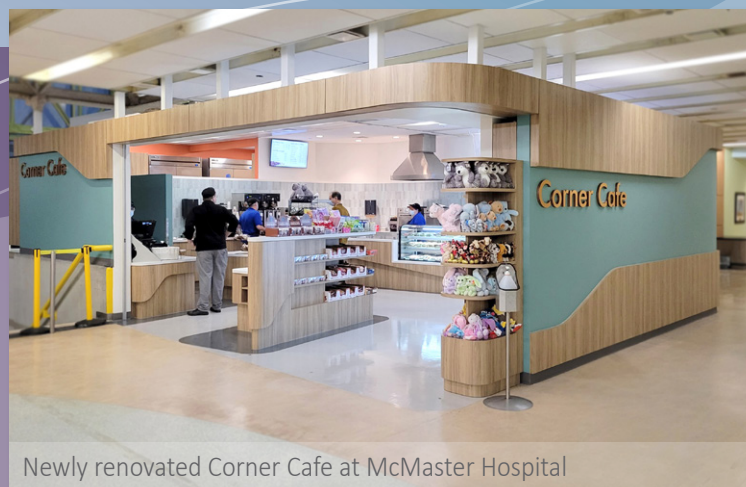
Newly renovated Corner Café at McMaster Hospital

Total Donations and Funding to Hamilton Health Sciences and Foundation $ 12,232,186